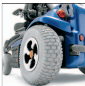
Large flat free tires for improved performance and reduced maintenance.