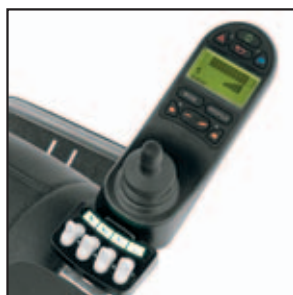
R-Net electronics for improved programmability.