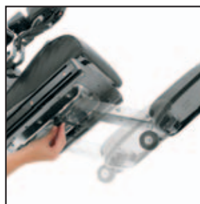
Tool-free adjustable legrest.