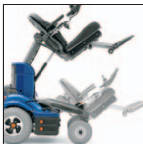
Optional 45° power tilt from any seat position.