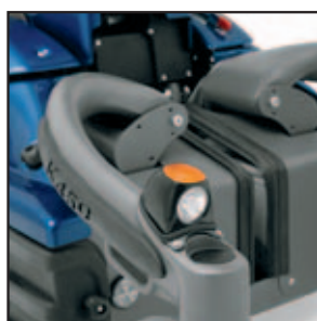
All-wheel suspension system for increased balance, improved ride and safety.