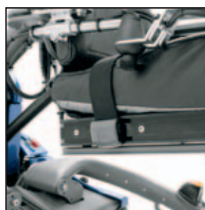
Uni-track system allows for extensive customization.