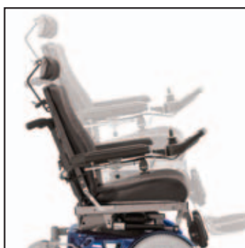
Power adjustable seat height.