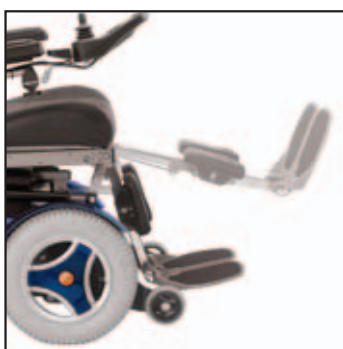
Power adjustable legrests.