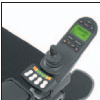
Rnet (Standard) Alternative Drive Controls available (Option).