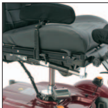
UniTrack: Complete and flexible support system (Option).