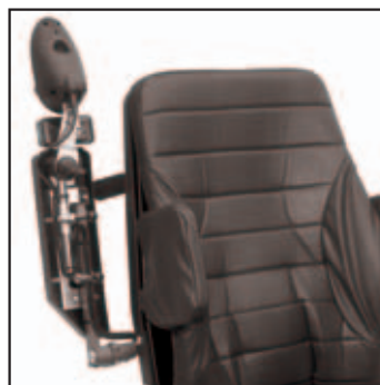
Flip-up armrests for easy transfer (Standard).