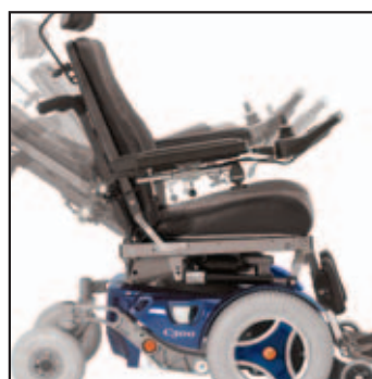
Power adjustable recline.