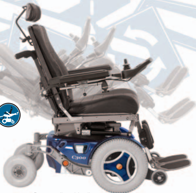
Power adjustable tilt.