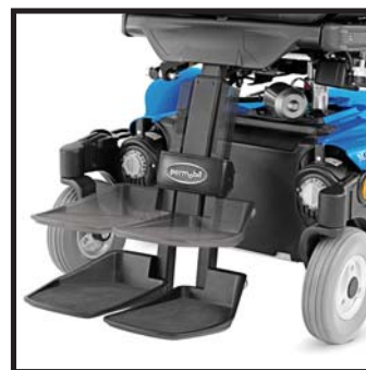
Independently adjustable legrest height