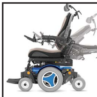
175° power recline