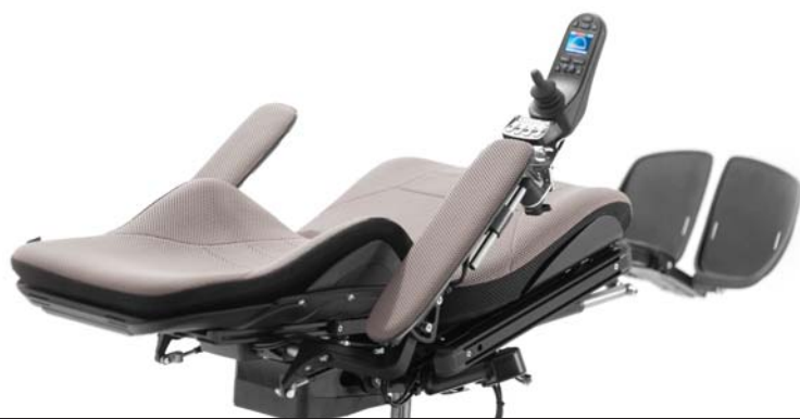
Fully-functional Corpus 3G seating system including power tilt, recline, and elevating legrests