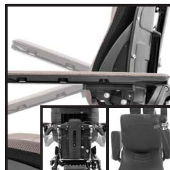
Independently adjustable armrest height, angle and pitch