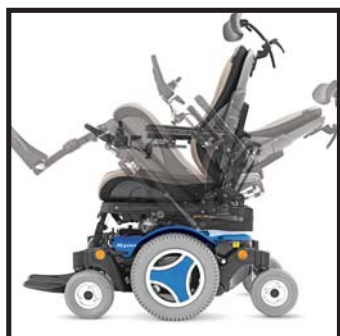
50° of tilt with two range selections