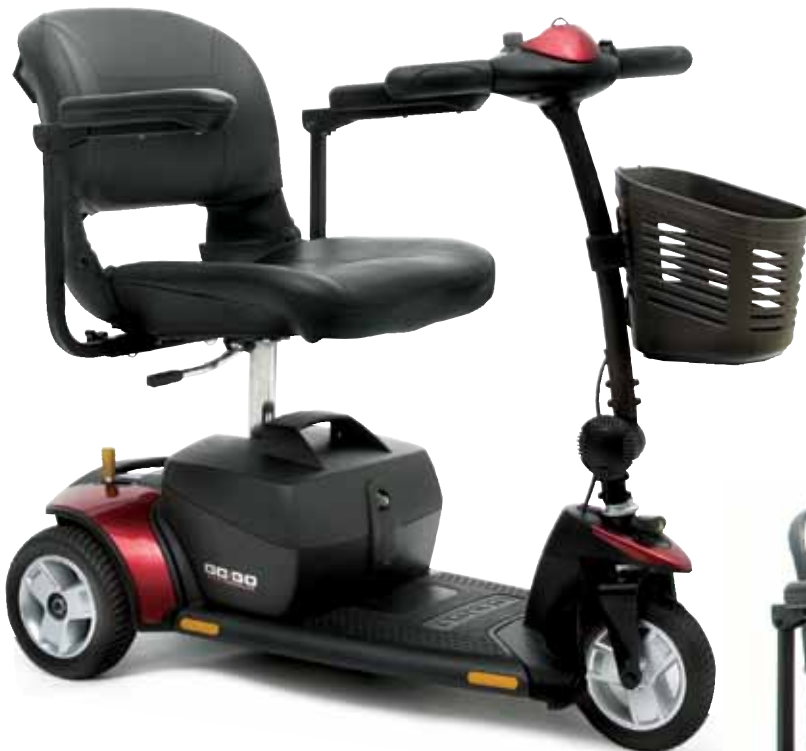
Go-Go Elite Traveller® 3-wheel

The Go-Go Elite Traveller®'s compact design allows it to easily maneuver in tight spaces while providing stable outdoor performance. Take the guesswork out of travel with simple, one hand feather-touch disassembly. Go where you want to go, easily, with the Go-Go Elite Traveller.