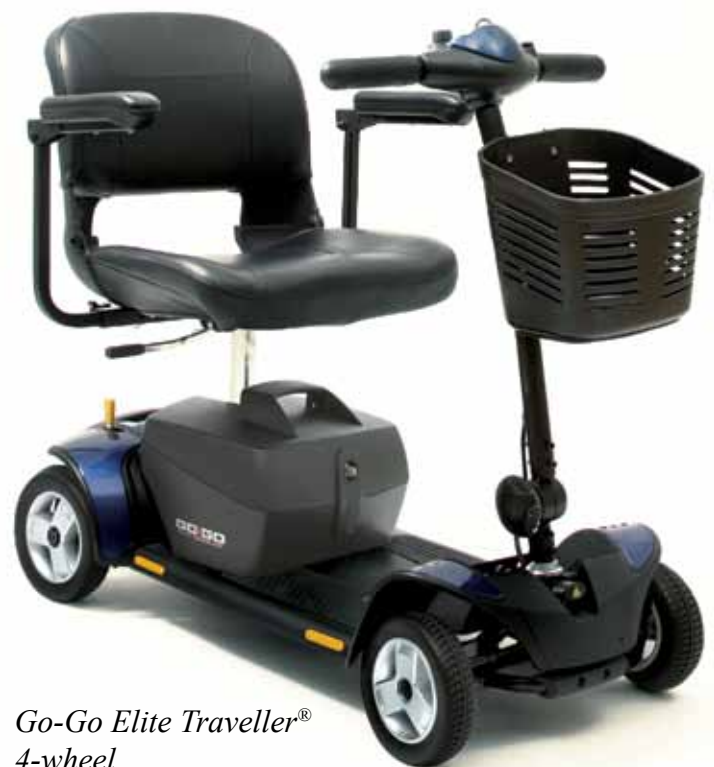
Go-Go Elite Traveller® 4-wheel

Pride® Mobility Products Co. — LIVE YOUR BEST —